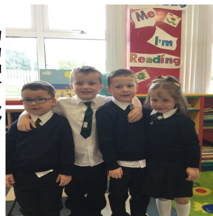
Our P1s on their first day of school.